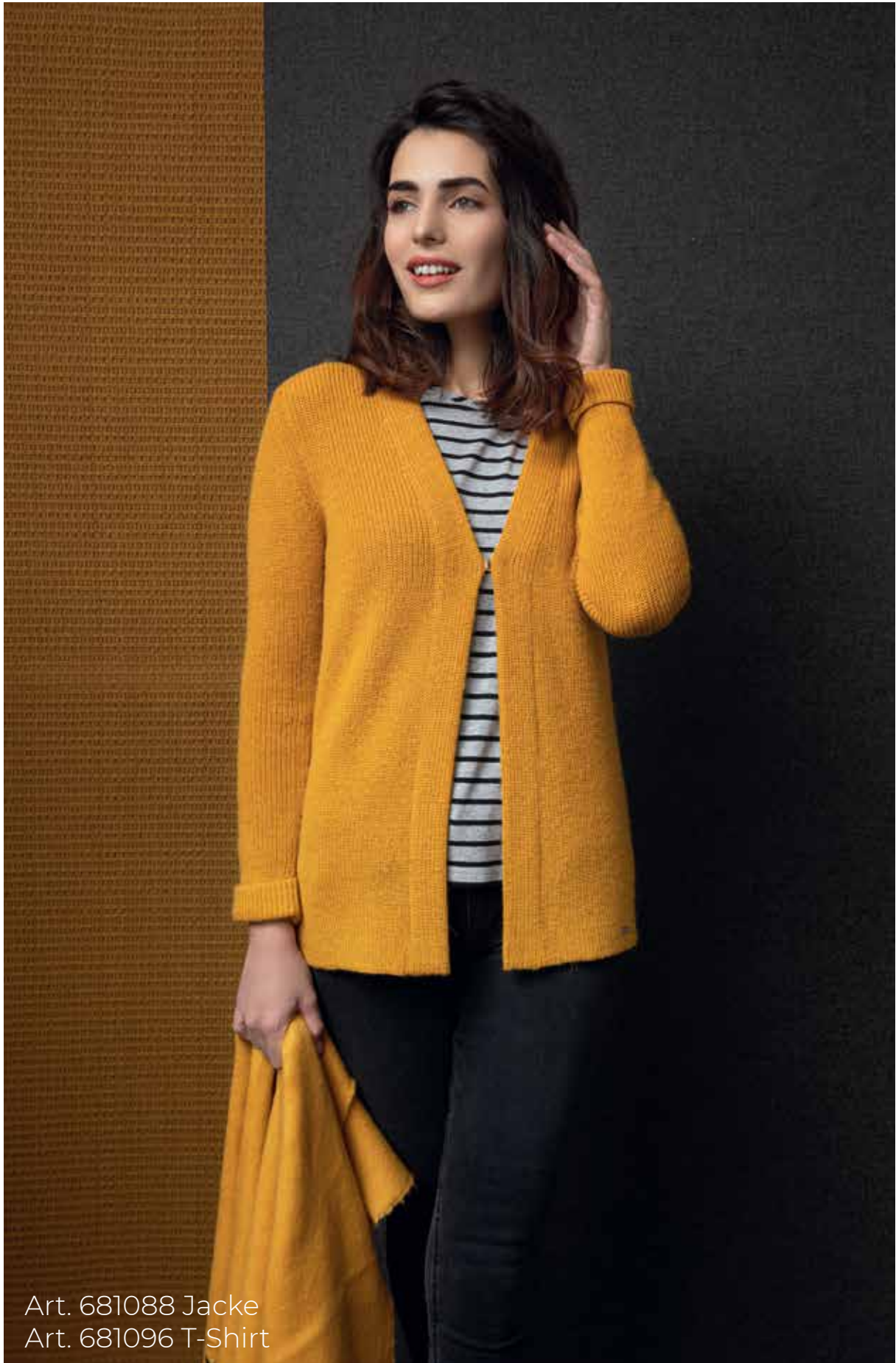
Art. 681088 Jacke Art. 681096 T-Shirt