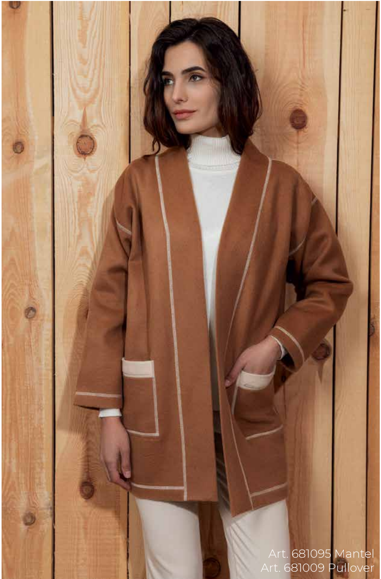
Art. 681095 Mantel Art. 681009 Pullover